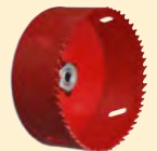
Cutter ( not included )

Dust collecting cover must be used with S-LOCK cutter and arbor. *Dust collecting cover can not be used alone.